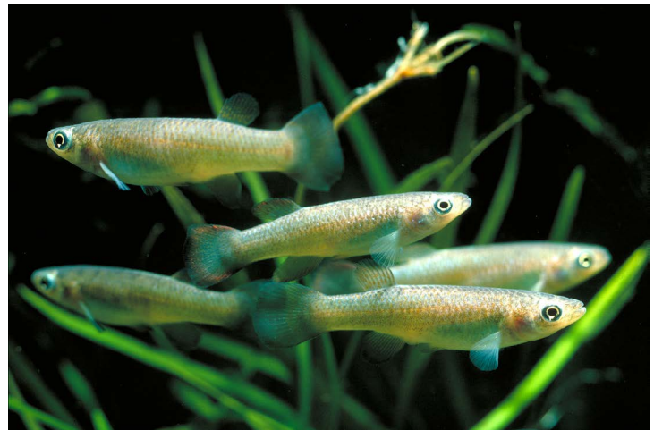
Plains Topminnow - Konrad Schmidt