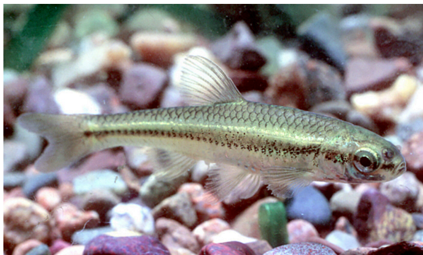
Pugnose Shiner - Konrad Schmidt